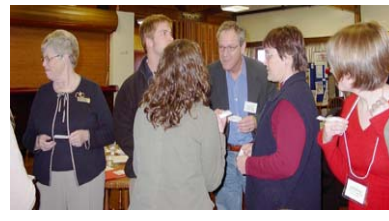
Coalition Building Workshop, AGM 2004