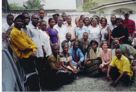
Participatory Monitoring & Evaluation Workshop, Calabar, Nigeria 2004

If you would like further information on any of the items listed above, please do not hesitate to contact me.