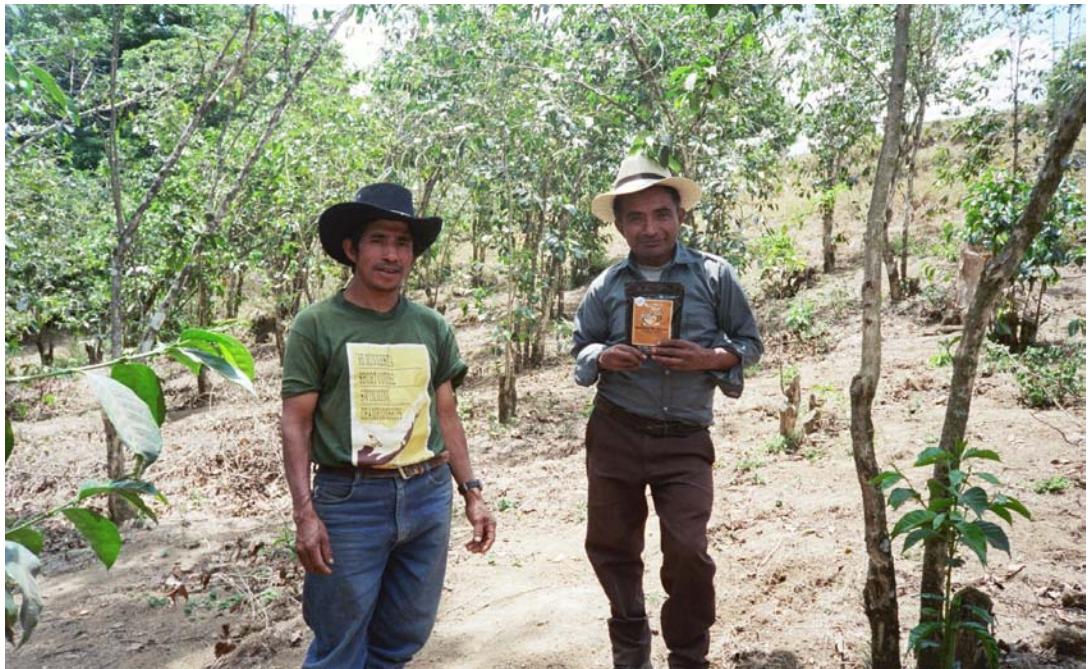
March 2004 Breaking the Silence delegation shared with CCDA coffee producers a sample of the final product.