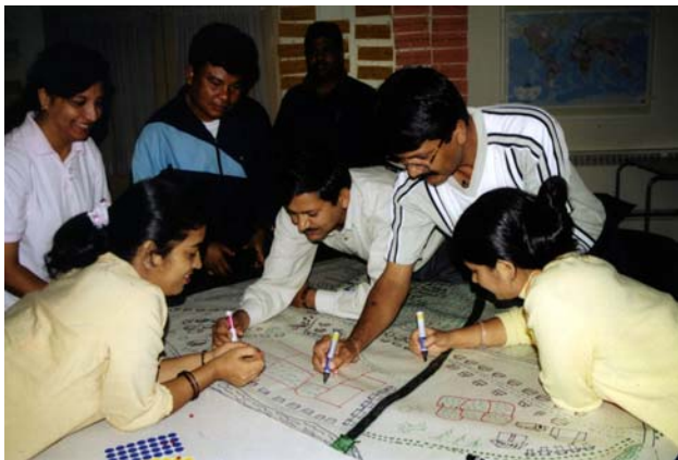
Participants in Community Based Dev. Dip. at Coady