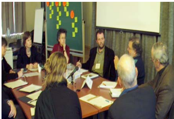
Building Knowledge in Partnership for Policy Influence Workshop—Montreal, December 2003

For more information, please consult CCIC's website at www.ccic.ca and for more information about the Policy Capacity Building project, please go directly to http://www.ccic...ca/e/002/capacity_building.shtml