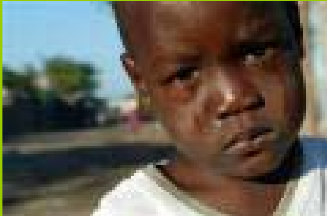
“A poor Dominican- Haitian boy cries in Barahona, Dominican Republic”

VSO Study: The Live Aid Legacy: The Developing World through British Eyes – a research Report